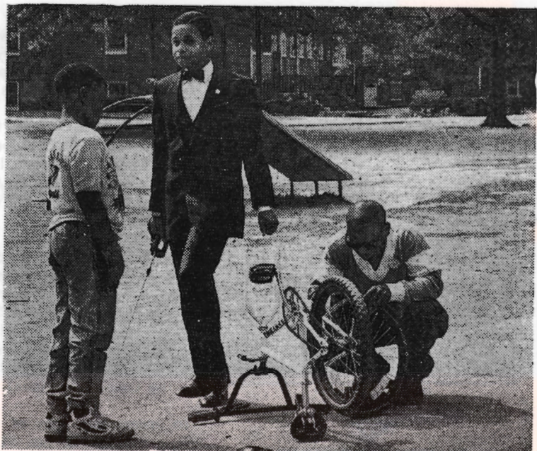
Two Muslims patrolling complex help a schoolboy, left, fix his bicycle tire.

Subscription Rates: USA $12 for 12 issues; Overseas $15 International Money Order for 12 issues.