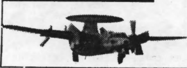
E2C HAWKEYE WARNING PLANE

The academy curriculum is designed to be equivalent to a regular college education so that the officer can get into post-graduate school which is a ticket that he must punch if he is to advance regularly in rank, and then get a plush job with a civilian contractor when he retires. The curriculum has nothing to do with preparing the cadet to lead men in battle.