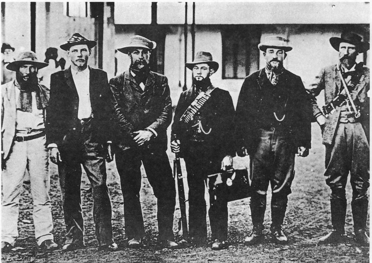
Boer General Christain De Wet (2nd from right) with his staff.

We will have more movie reviews in upcoming issues of The Nationalist . If you have seen a film that a national revolutionary should see please send us a short synopsis of it. 66