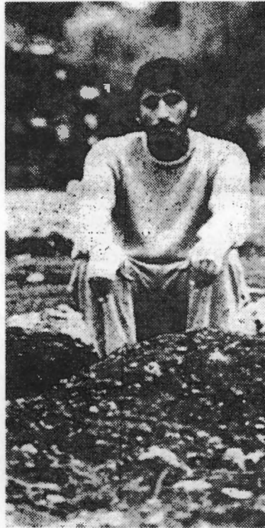
One of the Palestinians youths buried alive by Jewish soldiers.

The sadistic imagination of the ordinary Jew, which one sees manifested in the outrageous lies about the so-called Holocaust, is now on display for the world to see. It stuns human sensibility. The Holocaust tales should have tipped us off to the fascination of the Jews with human torture. But frankly, this latest incident even surprises us.