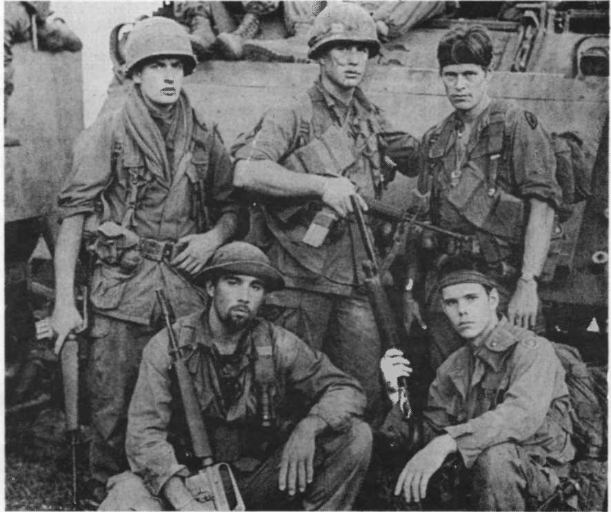
The cast of the pro-communist film Platoon .

Many racials see the movies as a vast artistic wasteland because the film industry is controlled by Jews with a sprinkling of White capitalists thrown in. We do not completely agree. Though the enemies of the White race do control Hollywood, some movies with nationalist themes do slip through. The VCR allows our people to rent these films for home viewing so we will try to identify worthwhile movies in this article. Some of these pictures are inspiring, some educational, and some just entertaining, but all fit into our worldview. The emotional power of film makes it the most important of modern art forms, at least from a political point of view, and in the future we must struggle to establish a nationalist film industry that can effectively compete with that of our capitalist and communist foes. The VCR will make this possible as it will allow us to skirt the System's distribution network. We can sell directly to the people through our propaganda organs.