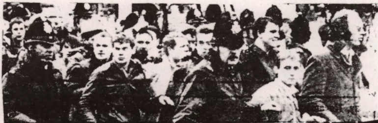
NF members make their way through the Red mob.