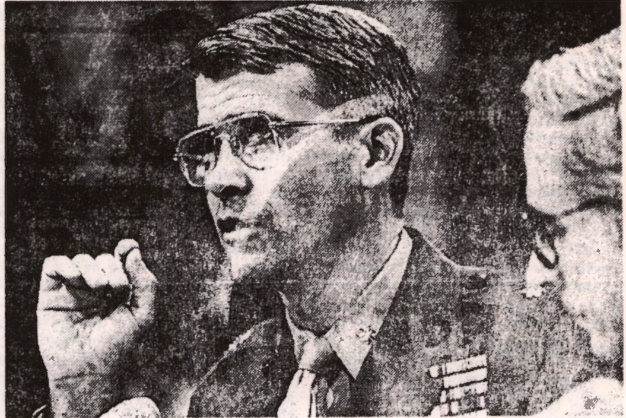
Lt. Col. Oliver North testifying. He did not back down or doubletalk.

But Brennan is correct on one point: Blacks and other "race-conscious" non-Whites, backed by the Jews and multiracialists, must demand forced hiring and special treatment because it serves them best. Meanwhile, the US Supreme Court will continue to pile one integration measure upon another, regardless of what the public really wants. In this way American society remains weak enough to be manipulated and abused by plutocrats and political self-seekers like Justice Brennan, for image or profit. MM