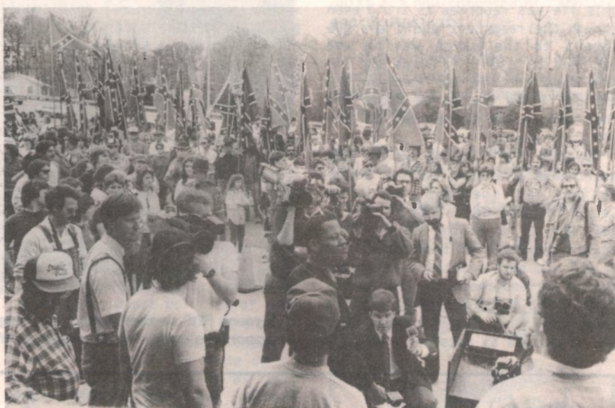
Close to 300 people showed up at the Colonial Heights courthouse to hear White Nationalist speakers from the SNF and NDF.