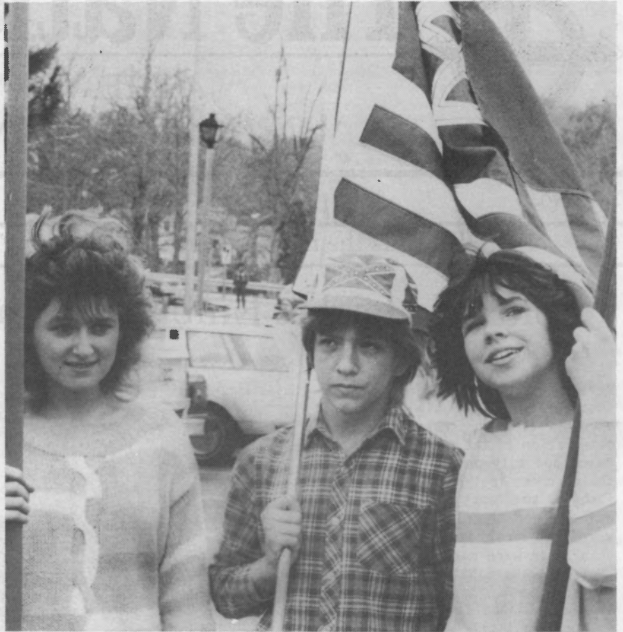
A young NDF member with the flag of our Movement flanked by two SNF supporters carrying Confederate flags in Colonial Heights.