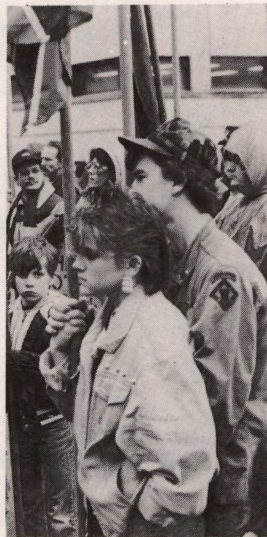
A determined young flag-bearer of the Southern National Front.

The SNF marched to the Confederate Memorial in downtown Raleigh where speeches were given in front of two beautiful, full color banners painted for the occasion by artist Will Williams. The banners represented the two themes of the march which were support of the Afrikaner Resistance Movement of South Africa