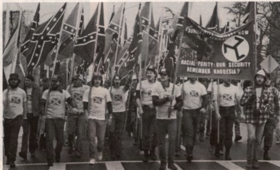
The Southern National Front on the march in Raleigh, North Carolina.

We can report that White Nationalism is alive and well in North Carolina. And it looks like a banner year for the Movement all round. 66