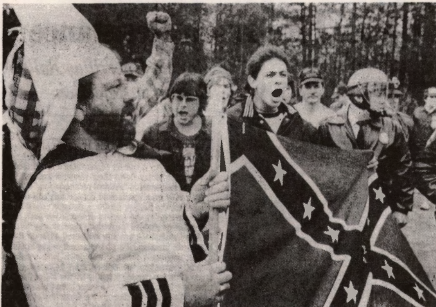
White residents of Forsyth County join with local Movement activists to turn back integrationist demonstration.