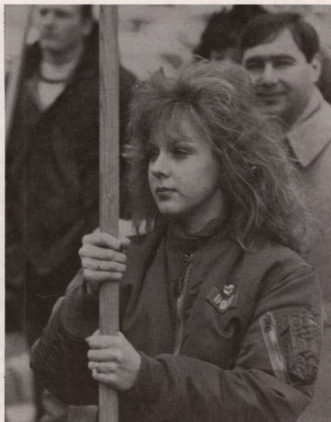
A lovely supporter of the Southern National Front.