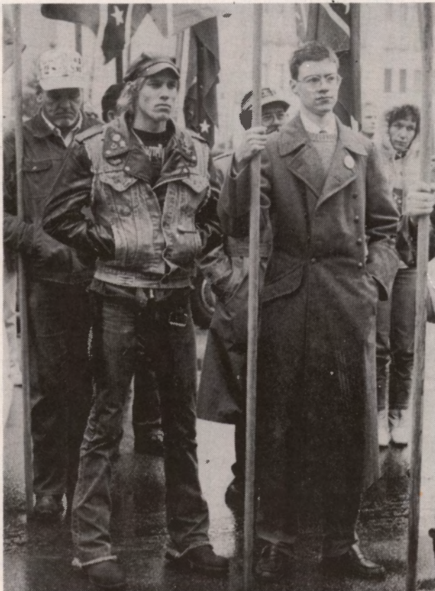
White workers and students united in the White Nationalist struggle.

The SNF produces an excellent newspaper called Frontline and preaches racial idealism rather than nigger-baiting. The SNF is at present smaller than the White Patriot Party was last year because the summer soldiers were frightened off by the big hammer that the System brought down on the WPP. The wheat was separated from the chaff and the best of the WPP joined the SNF which is now growing rapidly. The SNF has dropped the camouflage uniforms of the WPP for SNF T-shirts in a statement that is meant to discourage those who want to play soldier. The SNF is now looking only for those who are serious about White political revolution. The message is that the bluff and the games are over, now it is time for the hard work of political organizing. And North Carolina