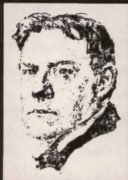
By HILAIRE BELLOC

THE RESTORATION OF PROPERTY by Hilaire Belloc, 78pp., $8.00. This is a crucial work on the alternative to capitalism and communism by one of the founders of the Distributist Movement.