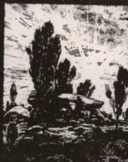
roots of the national-revolution

YESTERDAY & TOMORROW Edited by Rising Press, 96pp., $8.00 An excellent compilation of some of the best Nationalist writings of the twentieth century.