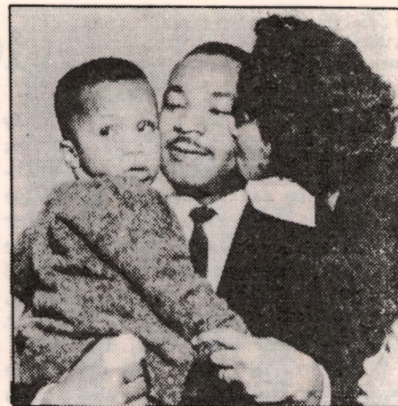
Martin Luther King and family According to his FBI file, King had so much love to give that he shared it with women all around the country.

Repression becomes especially severe when the ruling class feels itself threatened. For example, after the American Revolution, 80,000 Loyalists were rounded up and deported to Canada. Most of these Loyalists were tortured (tar and feathers for the men, rape for the women) and all lost their property. Why would a government supposedly committed to political