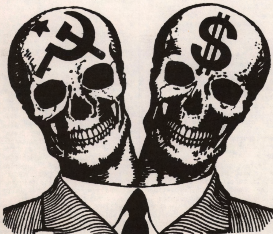
Are Communism and Capitalism really so different?

In Britain, the roots of capitalism can be traced back to the practice of usury during the thirteenth century. This fact exposes the Marxist interpretation of history as being fundamentally inaccurate.