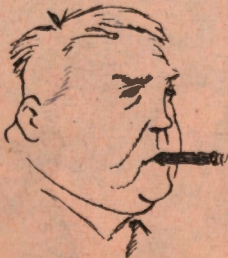
Chancellor Erhard... he won't forget!