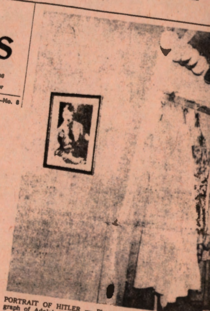
PORTRAIT OF HITLER — Photograph of Adolph Hitler hangs from wall of "Young Republican Club" office in Glendale, while khaki uniforms of the type worn by George Rockwell, American leader, also hangs from