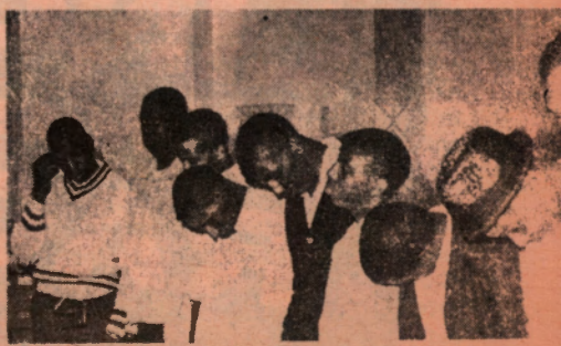
NEW YORK SUBWAY GANG AFTER ARRESTS "White Man, Your Time Is Up."

As the subway savagery mounted, New Yorkers—millions of them totally dependent on subways for transportation—began to feel desperate. Adding to their fear was a chilling slogan—"White Man, Your Time Is Up"—scrawled on subway station walls.