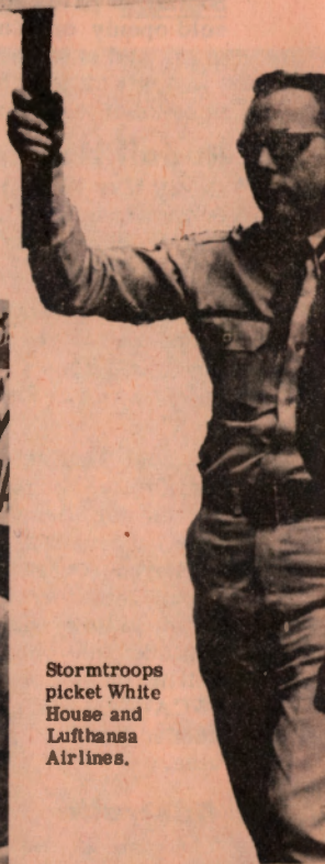
Stormtroops picket White House and Lufthansa Airlines.