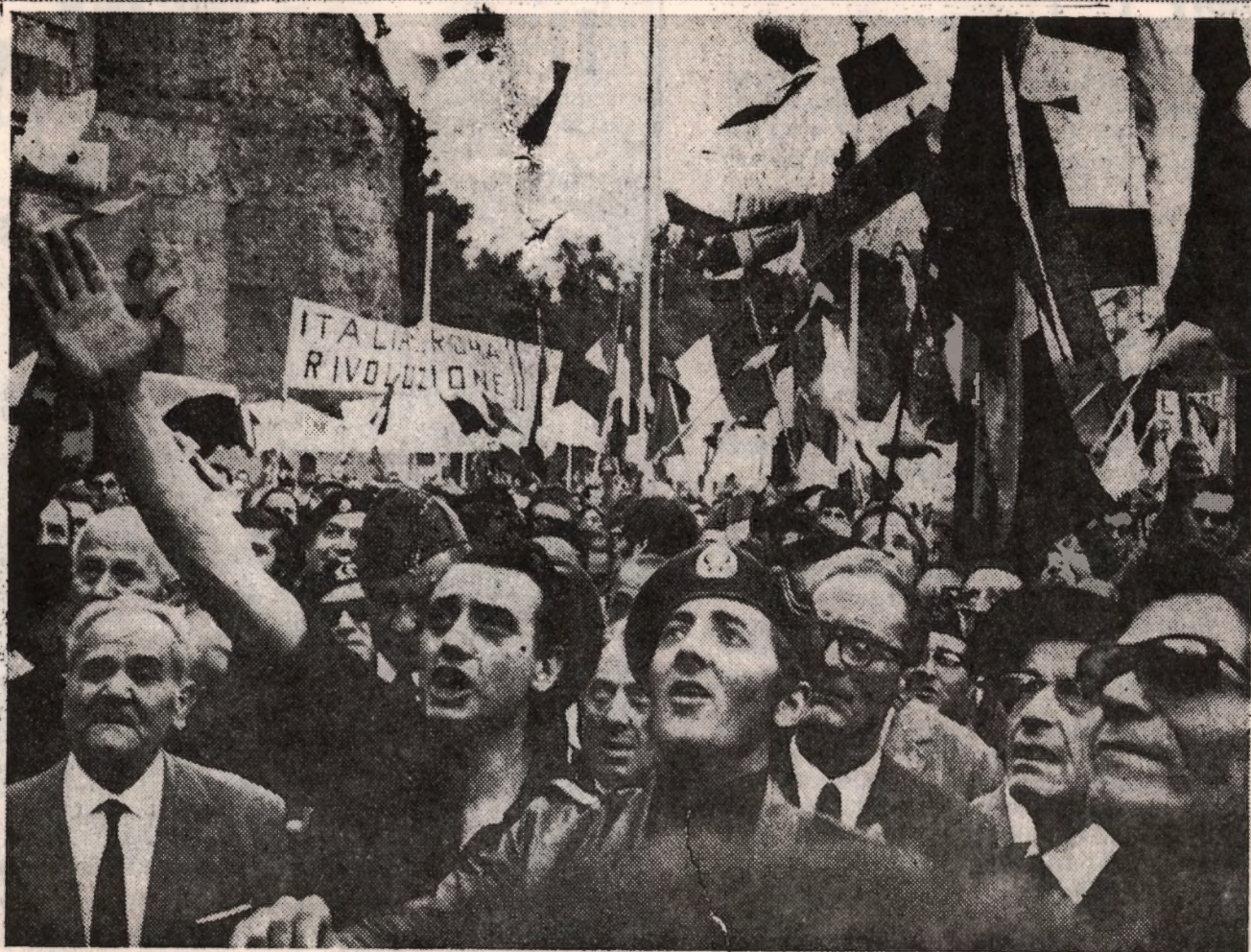
Neo-Fascists, many with blackshirts, rally in Rome.

Neo-Fascists, wearing crash helmets and even the blackshirts which are proscribed by government decree, have effectively swept Italian streets of the militant Reds who but a year ago arrogantly boasted that the streets belonged to them. Over 20,000 men have joined the MSI's Public Defense Committee which, in co-operation with Prince Valerio Borghese's Italian National Front, has wrought fear into the hearts of once self-confident Marxist terrorists.