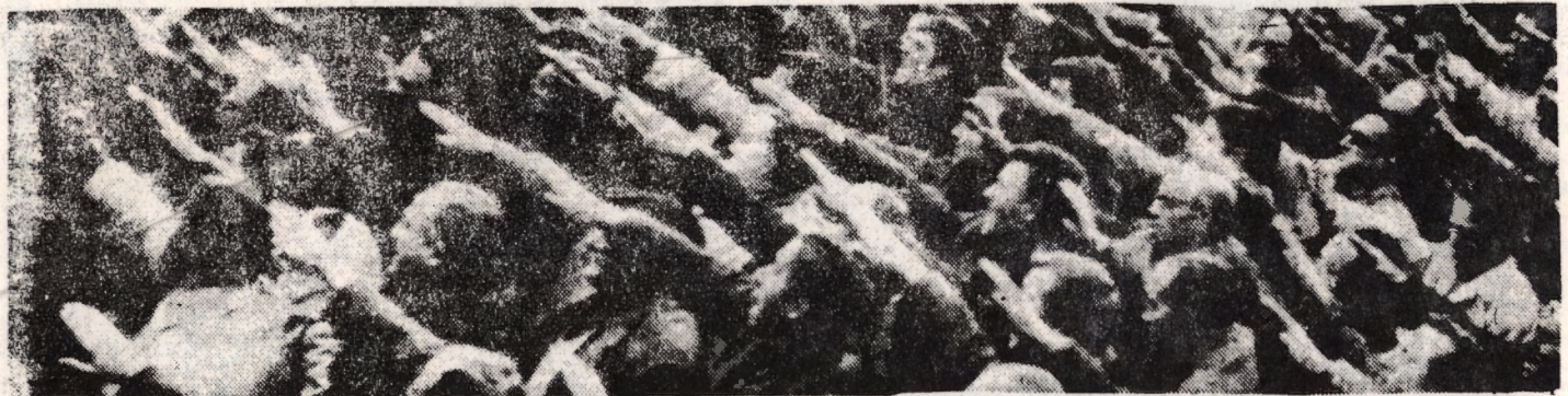
El Escorial, Spain — 3,000 Falangists give the Aryan salute at recent rally.