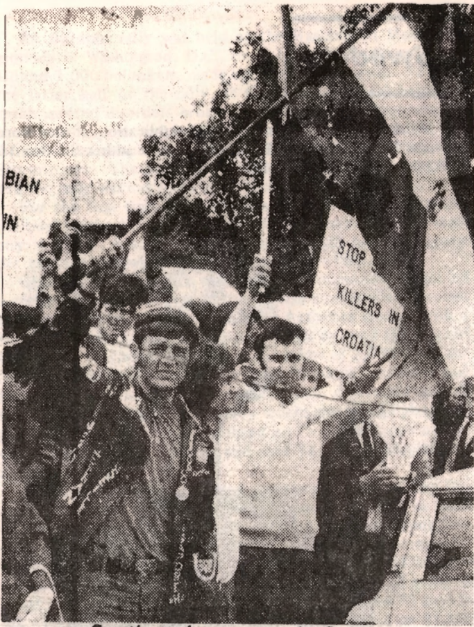
Croats demonstrate in Sydney