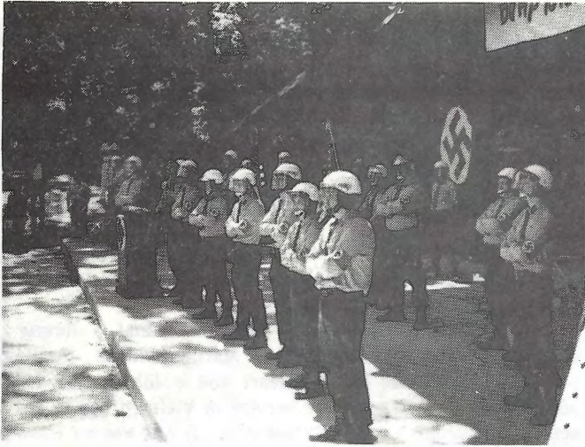
ST men stand ready beside speaker