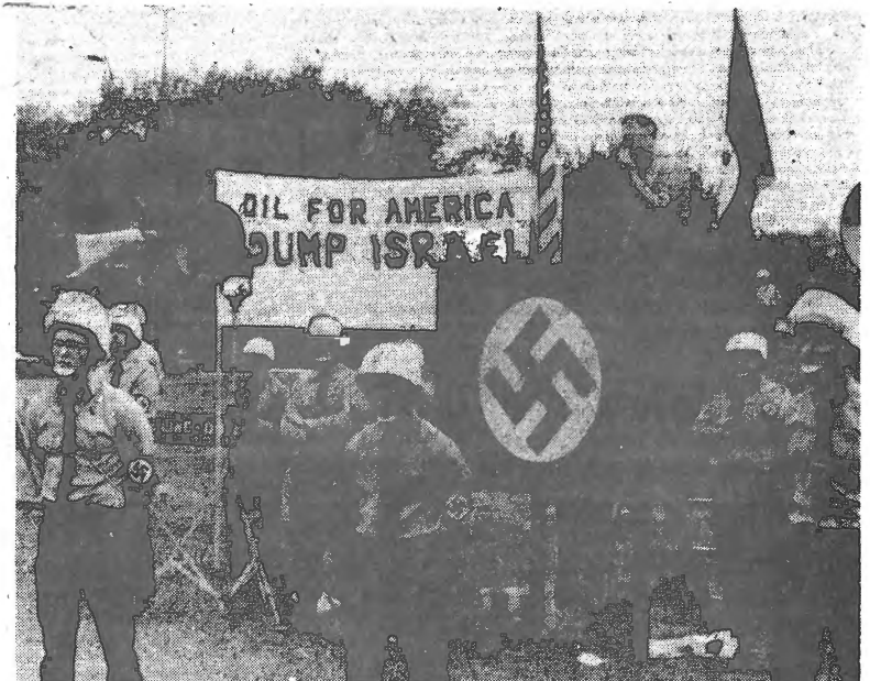
ST security force guarding speaker’s platform and sound system.