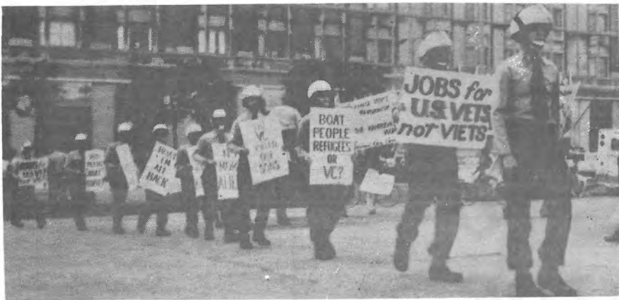
Stormtroops of the Chicago units picketing a pro-"boat people" rally on 22 July.