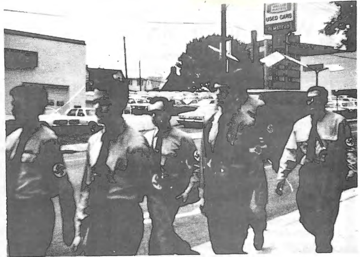
A contingent of ST men and NSYM members from the Arlington area march to a WHITE POWER distribution, held at the Smithsonian Institute, in Washington, D.C., on 14 July.