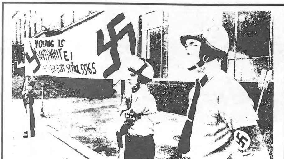
While Andrew Young spoke inside the Minnesota Museum of Art Thursday, three local Nazi Party members stood outside and across the street protesting the visit by America's ambassa-

Anyone wishing to get in touch with this new unit may do so by writing to the St. Paul Unit, Box 3084, St. Paul, Minn. 55165.