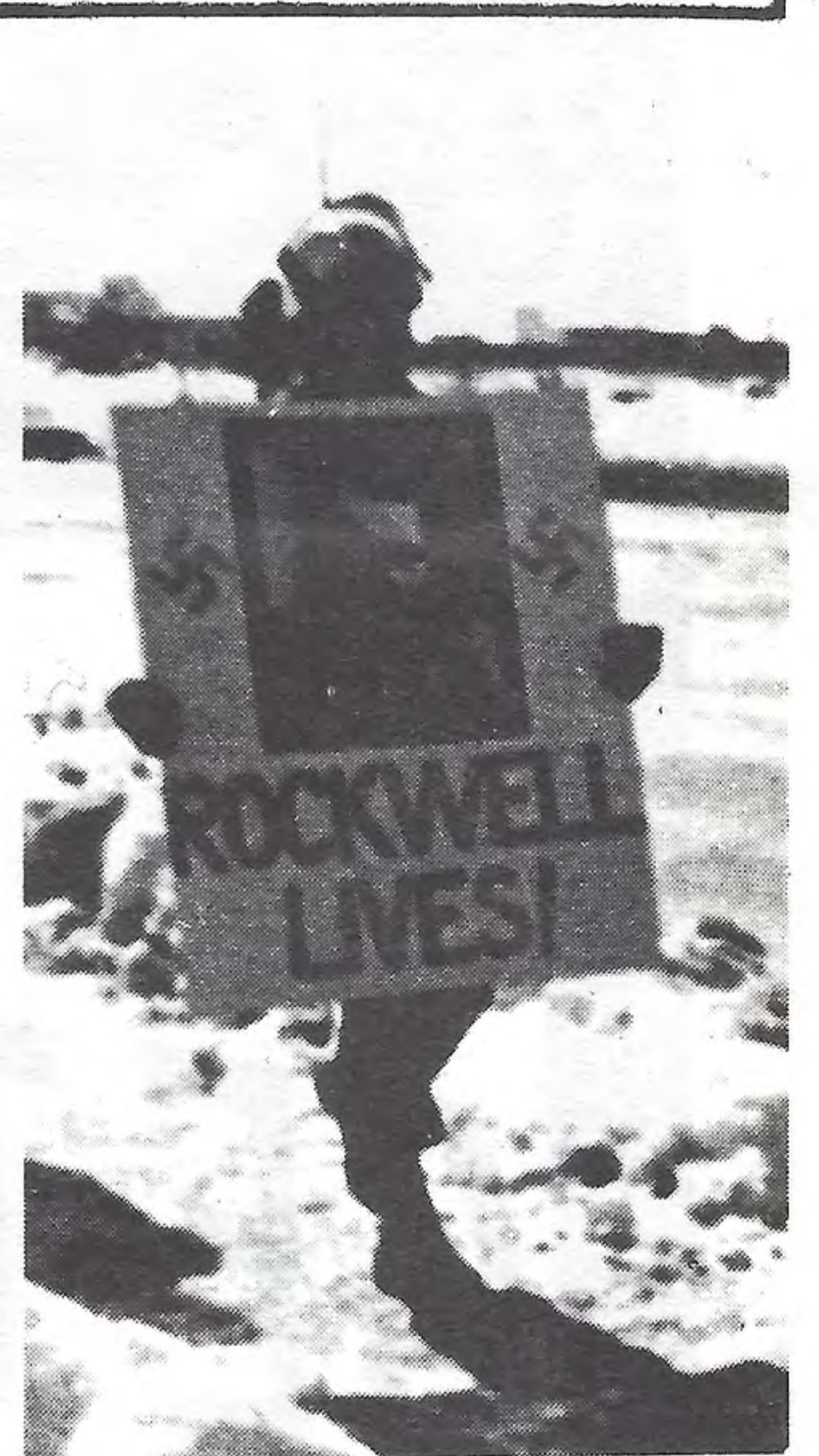
ST man protests 'Roots' slander in Minn.