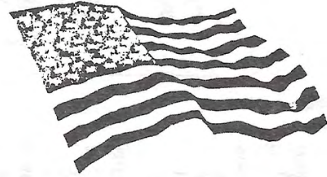
Invitation to Los Angeles 'Triumph' showing.

Presented by the Los Angeles Unit of the NATIONAL SOCIALIST WHITE PEOPLE'S PARTY Box 602 • Pasadena, CA 91102