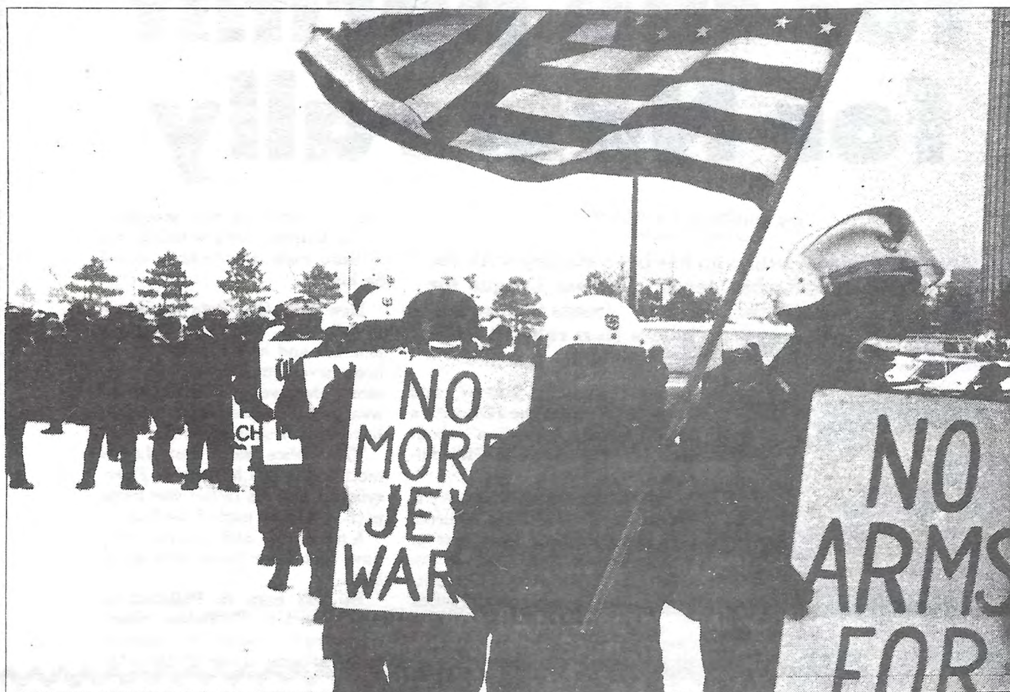
National Socialists picketing arms convention, protesting sale of U.S. weapons to the Jewish state in occupied Palestine.