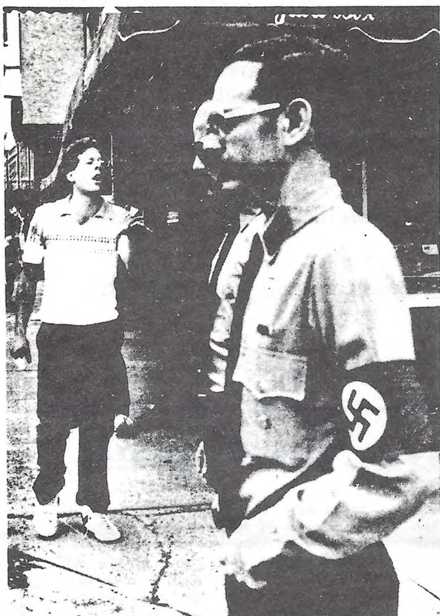
Citizen expresses his anti-Nazi feelings on Morristown Green.