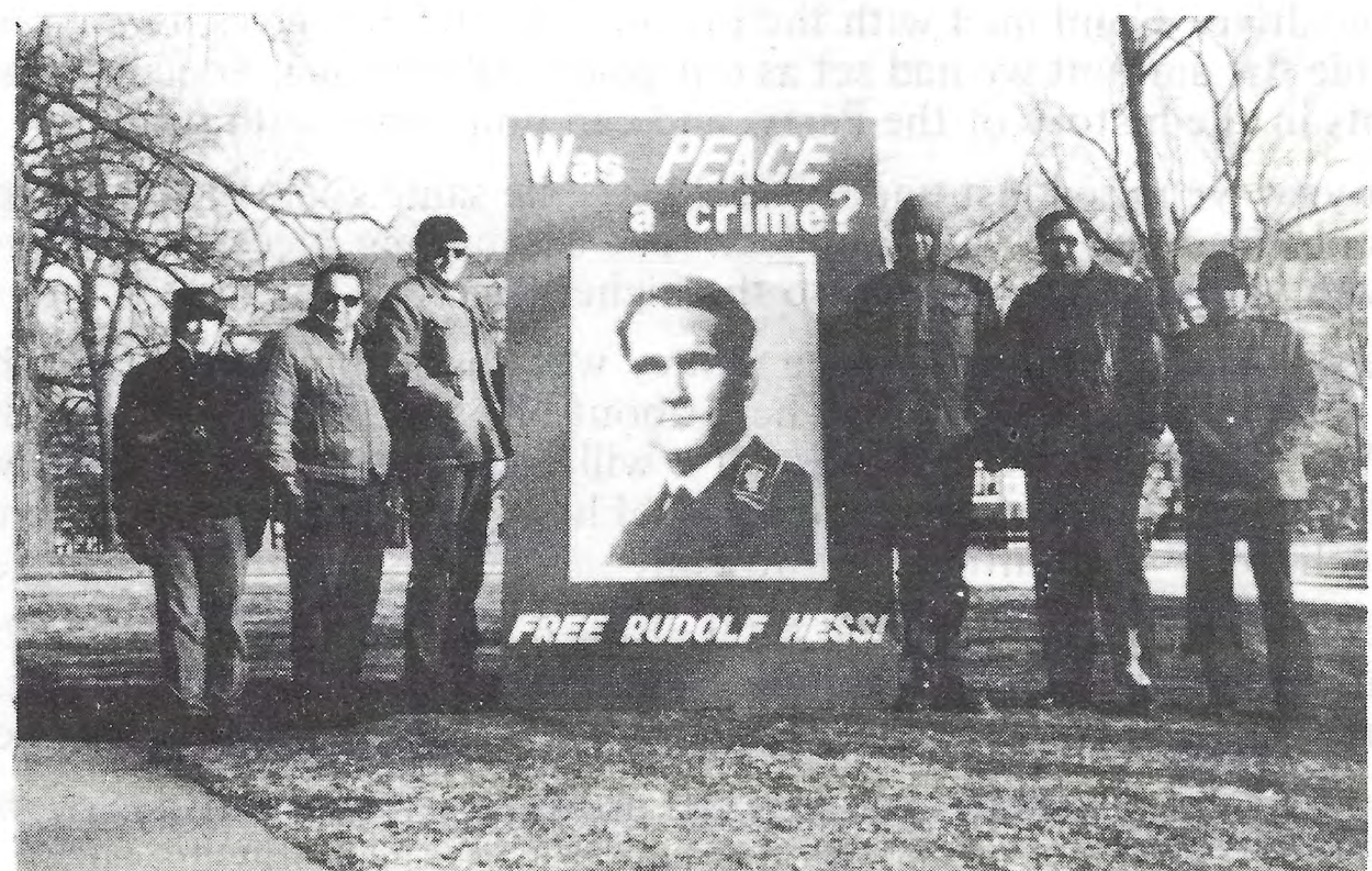
One annual "Free Rudolf Hess" vigil took place in Washington, D.C.

In spite of sub-freezing chill factors and rain the vigil was seen by thousands of people on hand for the national Christmas Pageant, held only a few yards away. The media,