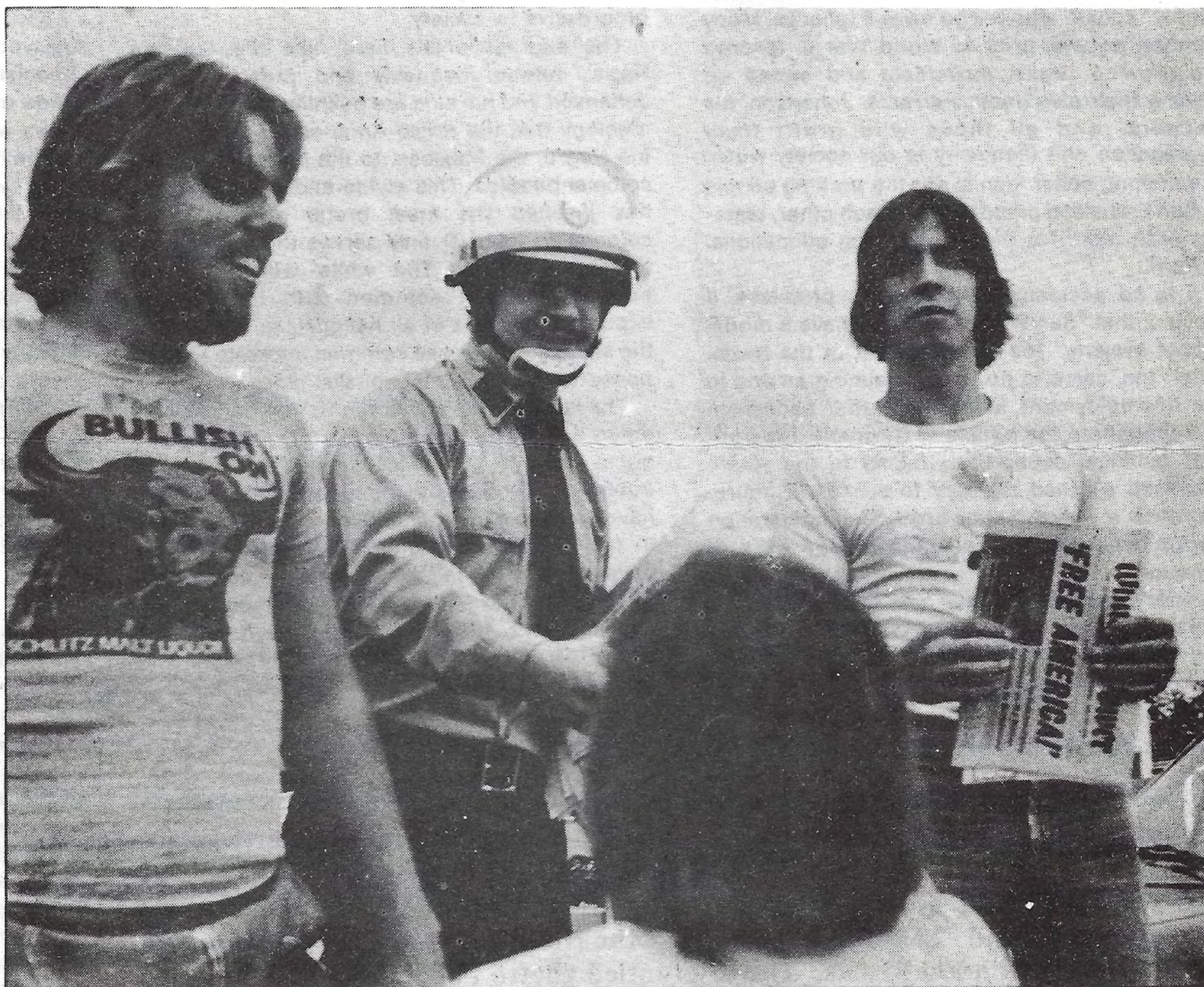
ST Voda handing out WHITE POWER newspapers to interested youth in Southwest Chicago

After the march the ST men boarded the White Power van and drove to Nathan Hale Park. A ball game was going on there, and the sight of the Swastikas and White Power slogans on the bus drew a large crowd of White youths. Within a few minutes handfuls of literature were handed out to the young people, who demonstrated their approval by shouting and saluting as the van left the park.