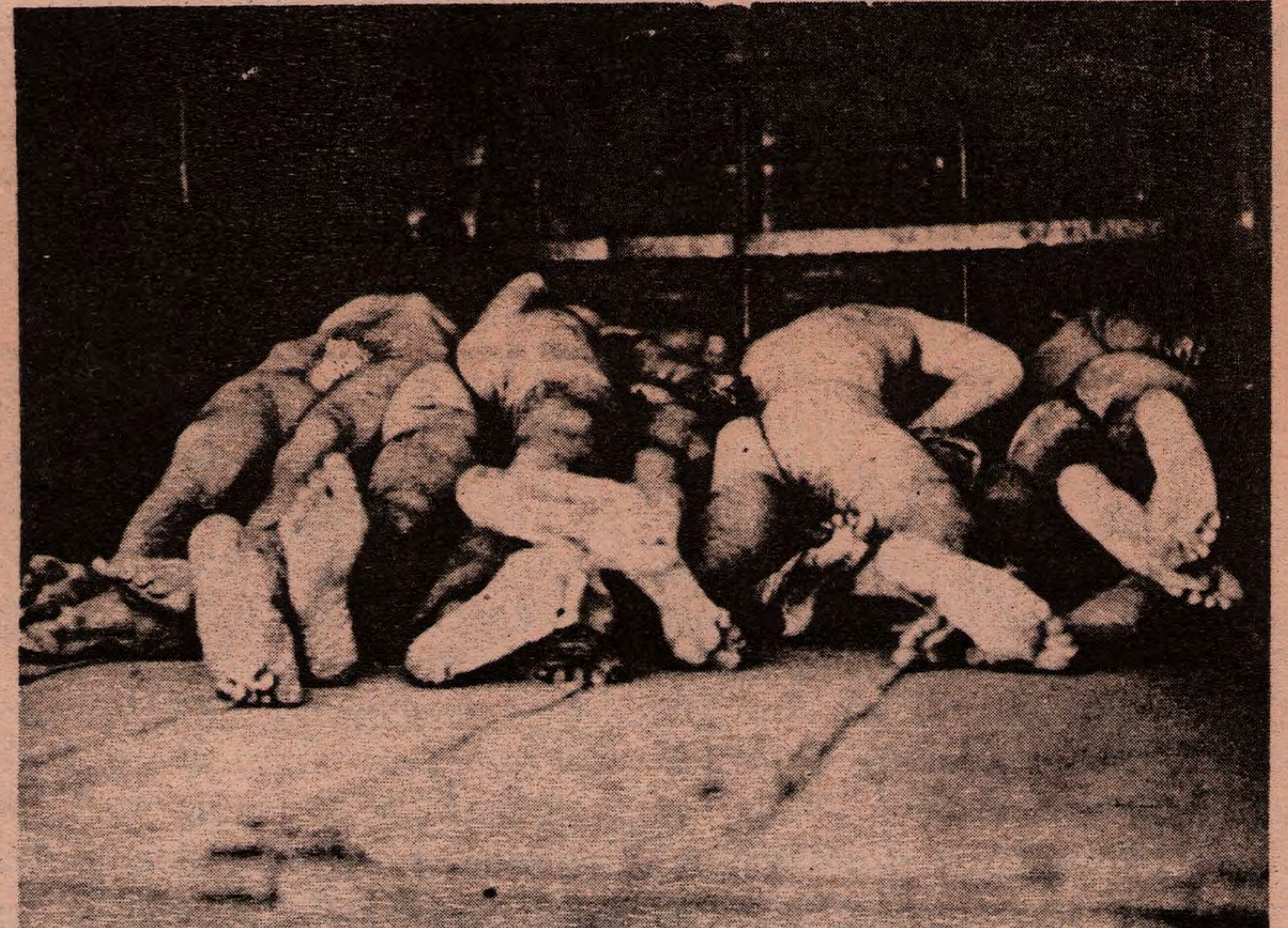
PHOTO taken of a few Arab victims of Deir Yassin April 10, 1948. Jew terrorists slaughtered 250 innocent men, women and children in the village of Deir Yassin. This was followed by other massacres which drove over one million Palestinians out of their homes and country.