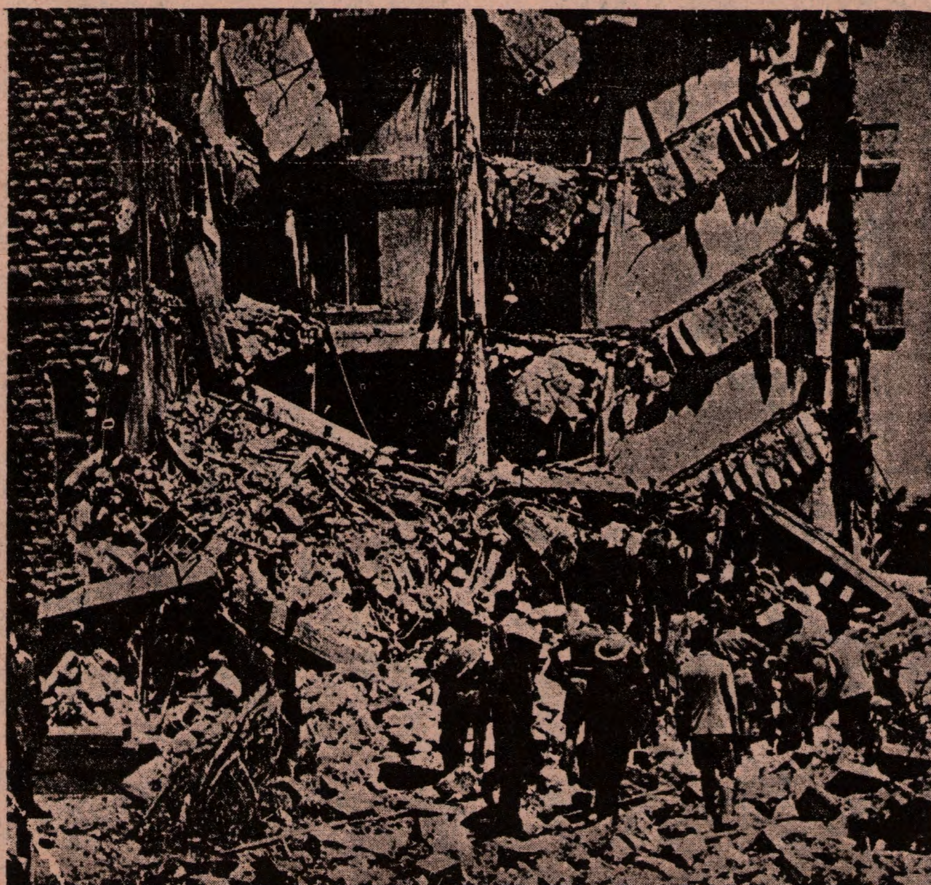
THIS TERROR bombing of the King David Hotel in Jerusalem left 105 English government employees dead. The "Stern Gang" claimed credit!