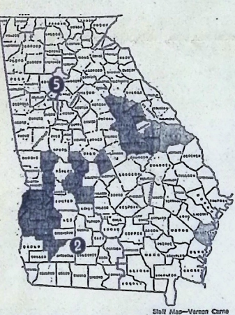
THE 23 COUNTIES IN GRAY HAVE BLACK MAJORITIES Numbers Show Targeted Congressional Districts

We also reproduce this map from the May 21, 1977, issue of The Atlanta Journal and Constitution entitled "23 Areas May Be Targeted for the Election