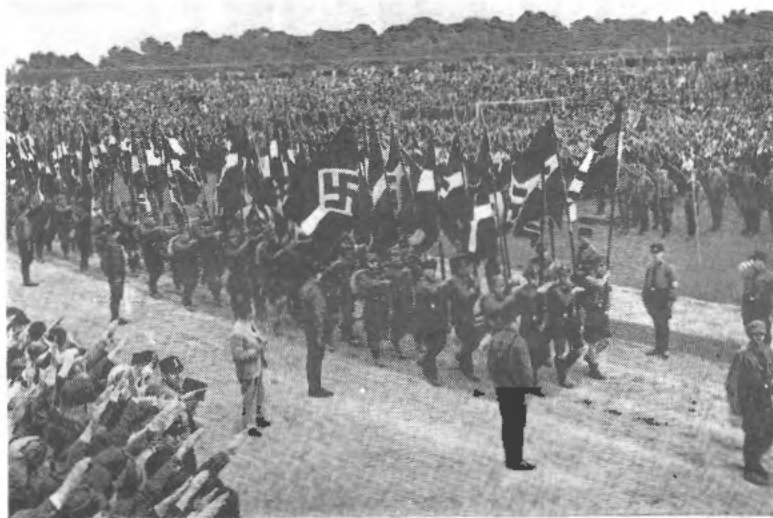
Hitlerjugendtag Potsdam, 1932

we are aware of dependence upon hereditary abilities and talents, we do not fall into the old error of overestimating educational measures and the effects of care and training; we are conscious of our responsibility to pass on our own heredity because only from it flows strength for the future. We are modest about every achievement of our own, for it has its roots in the abilities which we have received from our forebears without any doing on our part; and at the same time we're proud to see ourselves and our own short lives as links in the chain of generations and to feel that we are the bridge which leads from a great past into the most distant future.