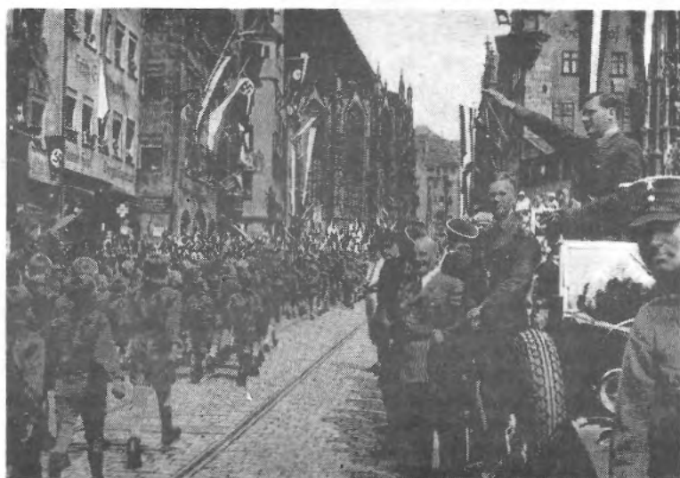
Hitlerjugend marschiert vor Rathaus von Nürnberg in Nürnberg, 1933

In the beginning, years ago in other words, when people first dared to speak of race in this rotten age of liberal-bourgeois thinking and Marxist corruption, they attacked the dangerous new ideas sharply on so-called scientific grounds. Some critics simply challenged the correctness of our biological findings. Armchair experts ridiculed racial knowledge and its teachers, and from lecterns, in editing rooms, and in meeting halls they tried to make it seem that they were dealing with only a handful of amusing fools and their wild imaginations. It is a good idea to look back today on that time and bring to mind once more the underhanded tactics of our ideology's foes. There were serious, experienced scientists even then who worked out the foundations of a completely new conception of things, while the opposition used all possible means of discrediting and slandering them, keeping up this barrage for years on end. The much-vaunted scientific freedom was trampled under foot because that suited the ruling powers of the time.