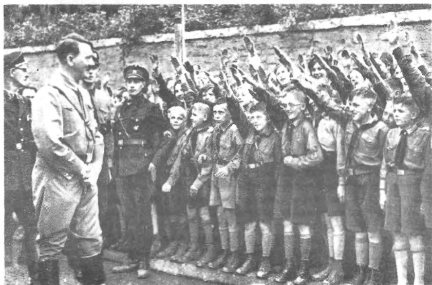
Sächsishe Jugend huldigt dem Führer in Leipzig, 1933