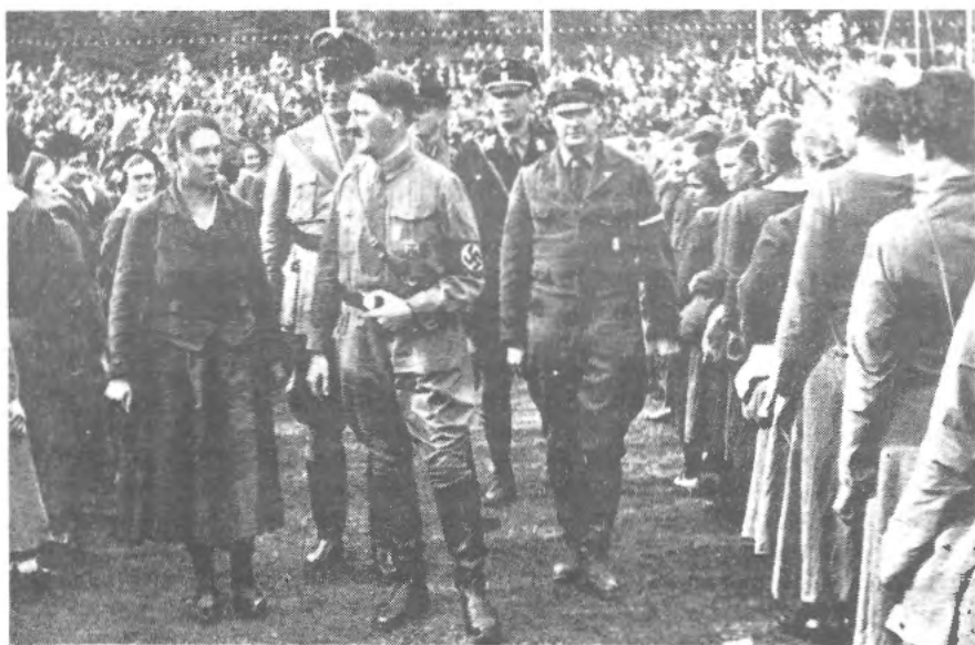
Reichsjugendtag in Potsdam, 1932