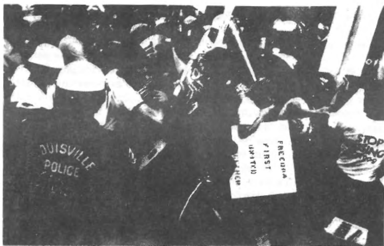
Anti-Busing Demonstration in Louisville, Ky.