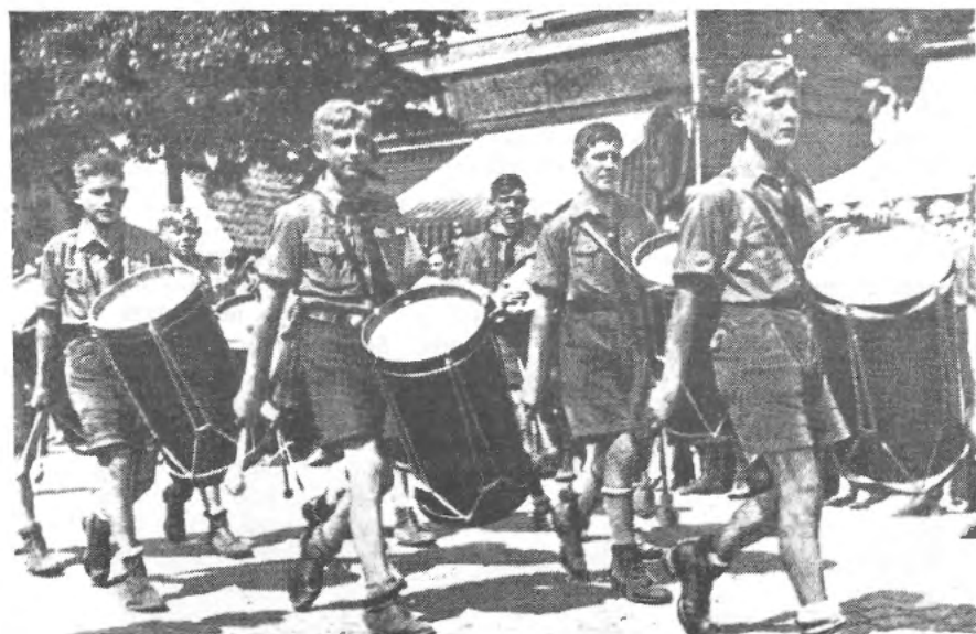
Trommeln, die zur deutschen Freiheit rufen

Now we have that part of the fight happily behind us.* Today it is clear to men in all camps and all countries of the world that one cannot seriously doubt the scientific and biological basis of our racial views, and all truly scientific discussions on this subject have for some time been devoted only to broadening our knowledge in individual areas, and the actual correctness of the basic ideas is no longer questioned. So things have quieted down in the world of science; the enemies of our beliefs have had to take up new positions in order to defend their old values against the modern age. They soon found a new slogan for the fight: "in the name of humanity and morality" people prepared to combat a view whose scientific merit could no longer be contested, but whose effects in national life might nevertheless be unbearable and even disastrous. You know what kind of accusations have come up in the course of months; for example, the theory of heredity is supposed to be dangerous because it relieves man of the responsibility for his own life and always gives him a chance to excuse his laziness, baseness and weakness of character as inherited tendencies. Worried old maids of both sexes wrung their hands and watched an age of immorality and