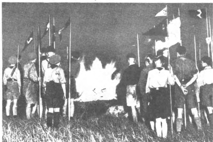
„Schwören am Flammenaltar, Deutsche zu sein“. — Sonnenwende der Hitlerjugend

new battle beginning in a new and, frankly speaking, more important area. Now the objection arises that while the National Socialist racial theory may be completely correct and may also be educationally and morally sound, it must nevertheless be rejected in the name of faith, religion and piety. It is said that we are on the point of putting blood in the place of God as a sort of idol, thereby replacing the human soul with a man-made theory, or at best with body and matter.