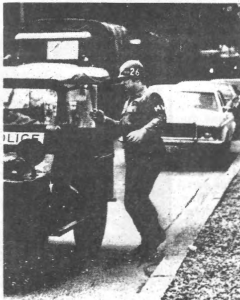
NATIONAL GUARD TROOPS IN BOSTON

The jews control America and in many areas control courts. The police are an arm of the State and as such carry out the orders of the jews. Whether they are 'conservative' or not means nothing if they are willing to club, beat and kill White men if ordered to do so by the jews who run the Establishment.