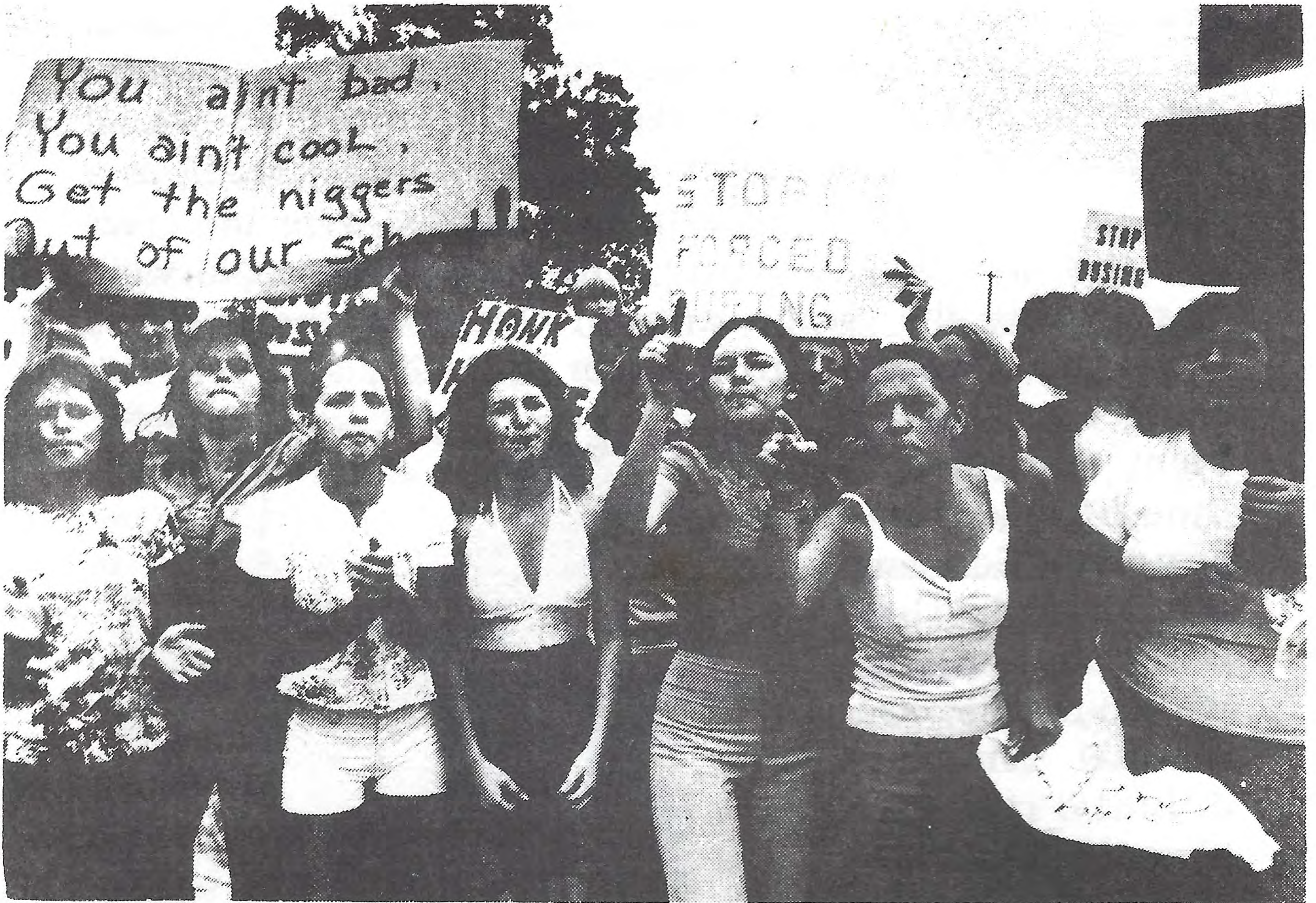
BOYCOTTING STUDENTS AT FAIRDALE HIGH IN JEFFERSON COUNTY, KY.

With the increased scope and rapidity of communications and the burgeoning of non-White, race-based nationalism throughout the world, no less in America, White people are drawing closer together. In fact, we are