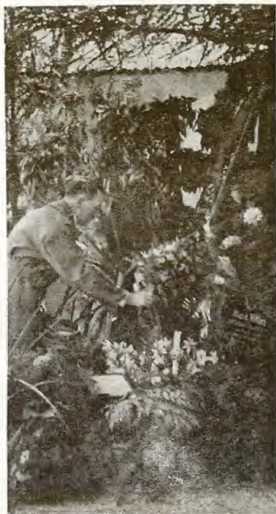
A man of kind and tender consideration.