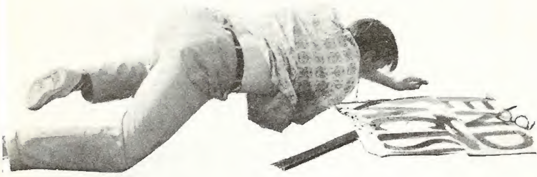
JEW COMMUNIST PICKET beaten bloody by Nazi fists.