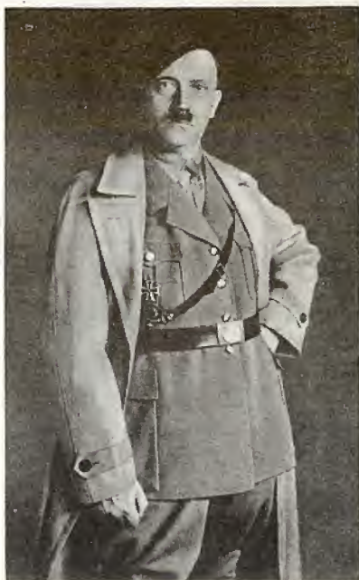
The mighty leader.