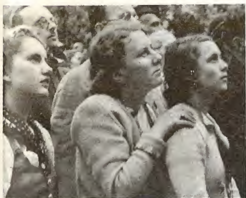
Inspiration to youth.