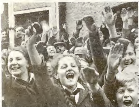
Loved by his people.