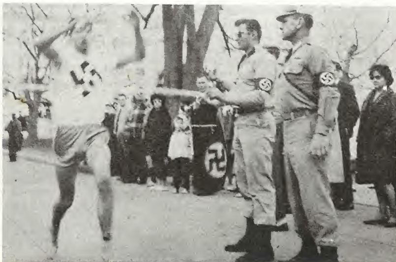
Driving finish!!! Cheers ring out. The Jews stand silent, defeated.