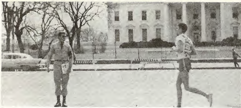
Grinding out the miles, as Trooper guards against Jew attacks.