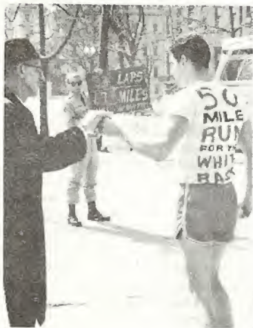
Grabbing a quick drink of water, on the run.