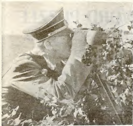
Man of courage, on the front.