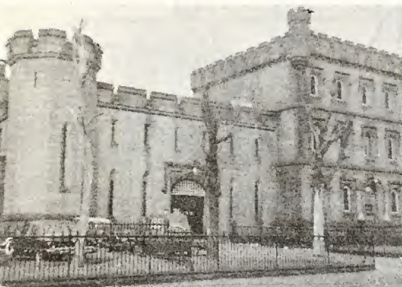
THE STONE WALLS -- which cruelly confine five courageous heroes, Moya- mensing Prison.

in the meantime, was seen darting out a rear door--in his shirt sleeves --too afraid to face the Nazis.