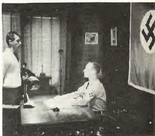
Being logged in by Duty Officer