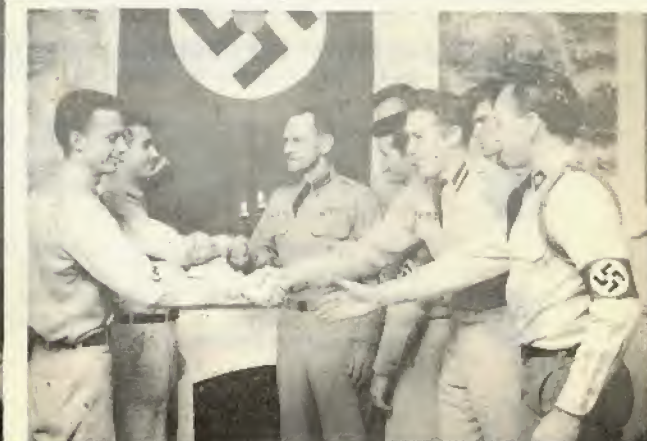
Congratulations from Officers