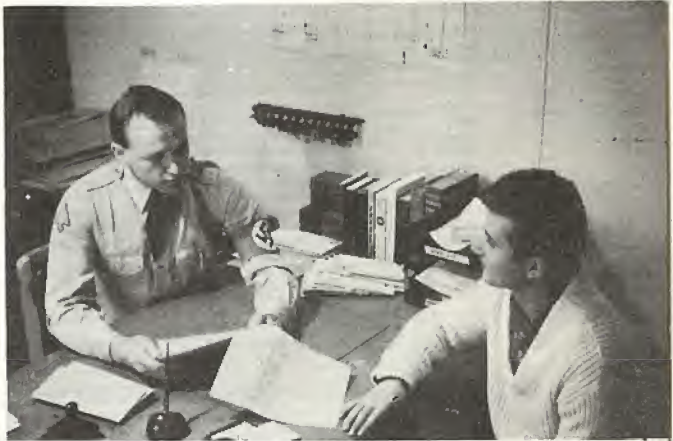
National Secretary checks completed, notarized blank.