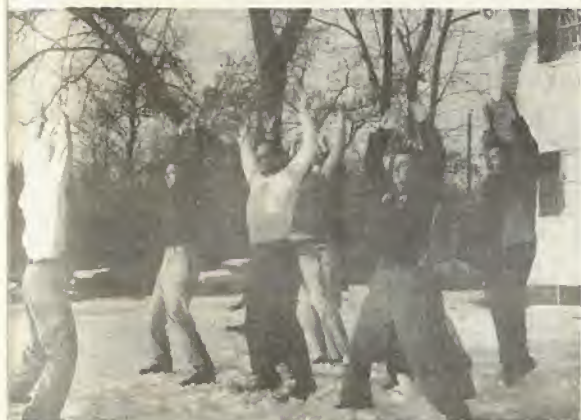
"P.T." on a bitter cold morning in the snow.