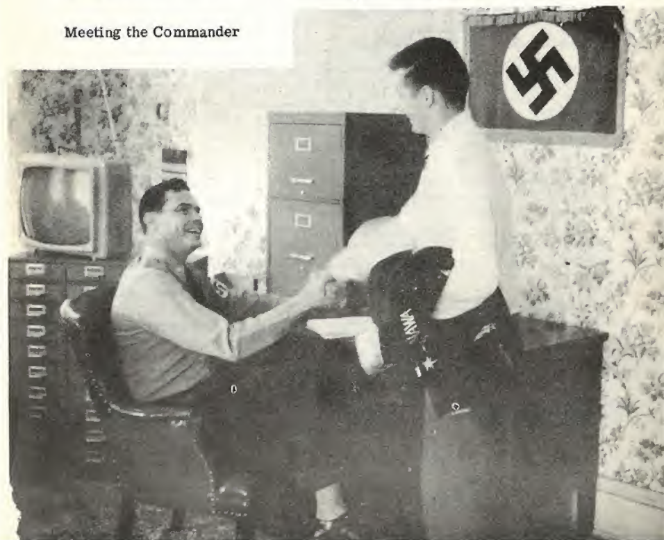
Meeting the Commander