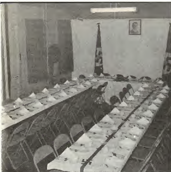
Banquet Room, Vinland Hall, Chicago.