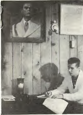
Filling out lengthy application blank.