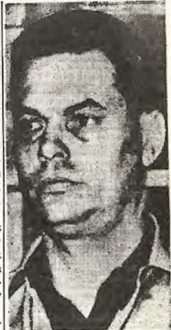
GEORGE L. ROCKWELL "How right the Fuehrer was!"

The speed with which Rockwell's Nazis have worked to capitalize on Eichmann's execution has flabbergasted German officials. Much of the material apparently was prepared long in advance of Eichmann's death, and some of it, judging from the speed