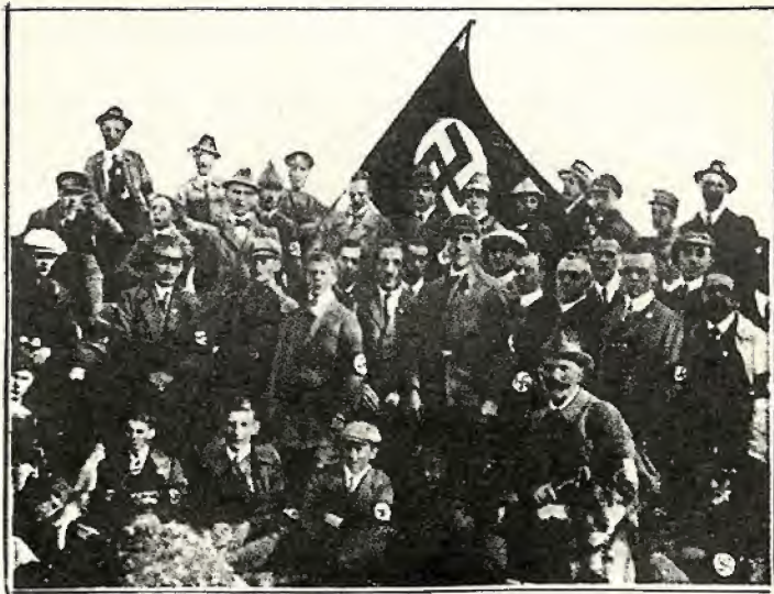
A RARE OLD PHOTOGRAPH of the German Nazi Party in the early days when they were poor and struggling as we are now. Note the lack of uniforms.

But the RESULTS of this historic meeting will shake the earth and send the hate-crazed Jews screaming into "orbit" with fear!