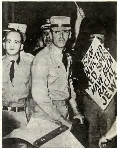
American Nazi member of race-baiting group headed by George Lincoln Rockwell, uses picket sign in effort to hold off spectators at 15th and Locust.