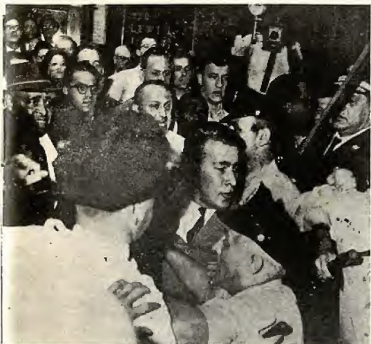
The Face of an American Nazi

The street before the ADL was RED with Jew blood!