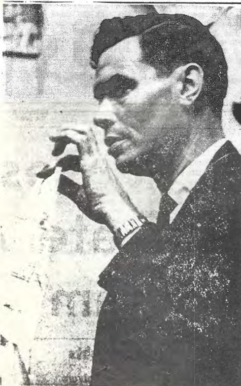
COUNTERING charges from critics who say he is mentally ill, George Lincoln Rockwell displays a document signed by a psychologist stating he is emotionally and mentally normal.