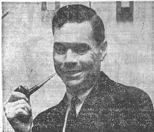
GEORGE ROCKWELL AT CARLETON 'Democracy, Communism the same'

"That way we'll make this a decent country again for the white Christian Americans who built it."