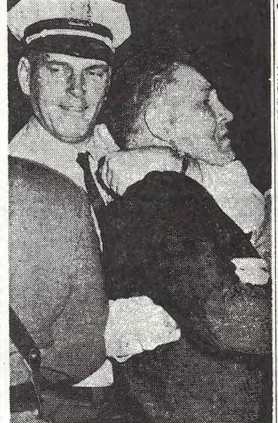
CLAMPED IN STRANGLEHOLD by policeman, a participant in near-riot is led to police wagon. Man was released after Nazis were hauled off to police station.