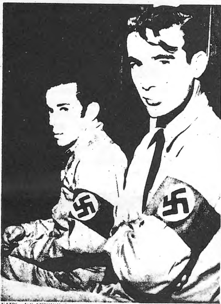
NAZIS U.S. VERSION: two toughs of Rockwell's Nazi-style party in police custody after demonstrating against Sammy Davis, the Jewish Negro entertainer, marrying a white girl (see page 1; Hain to McGovern?)

efforts, particularly through the assistance of neutral countries, and the liberal supply of visas and immigration certificates to the Jewish National Home.