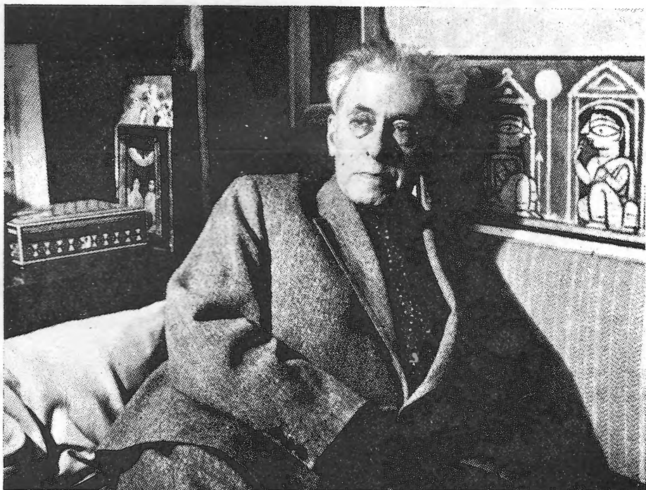
Portrait by ID: 1

As soon as the text of Ehrenburg's speech had become known in the West, a number of Jewish journalists proceeded to comment that, at long last, Ehrenburg had remembered that he was a Jew. The comment is not fair, for there is nothing new about Ehrenburg's attitude. Three years ago, in his autobiographical sketch for the two-volume edition of Sovetskie Pisateli ( Soviet Writers' Who's Who ), he said: "I cannot speak Yiddish, but as for my being a Jew, I have more than once been reminded of the fact by people who, apparently, believe that human blood has some special racial characteristics. I am not a racist, I have never been one, but so long as there exist racists I answer when asked about my nationality: 'I am a Jew.'"