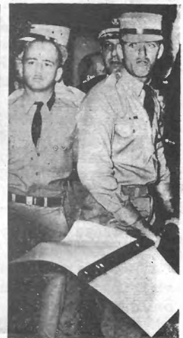
One picket uses his sign to fend off attackers in front of the B'nai B'rith Anti-Defamation League.