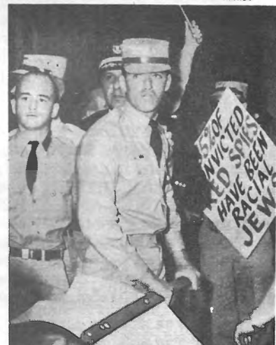
American Nazi, member of race-baiting group headed by George Lincoln Rockwell, uses picket sign in effort to hold off spectators at 15th and Locust.