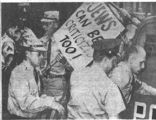
Wearing storm trooper uniforms and carrying anti-Jewish signs, six self-styled Nazis are hustled into a patrol wagon by Philadelphia police Tuesday after they were attacked by spectators watching the group picket a Jewish office building in center city.

READING TIMES, READING, PA., WEDNESDAY MORN