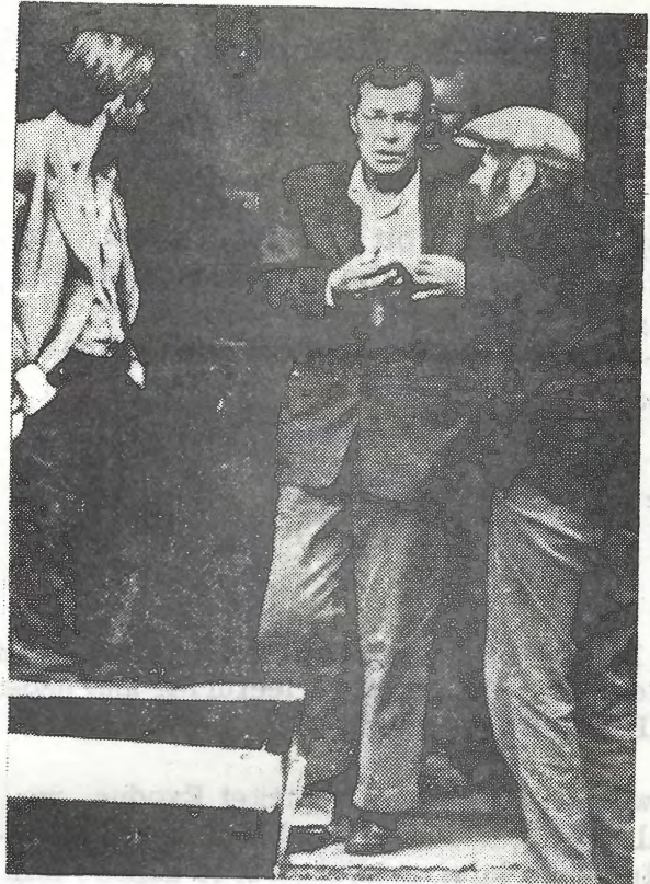
Row men leave a building with bottles of wine they had purchased after they said they received $1 from Democratic precinct workers for voting in polling places.