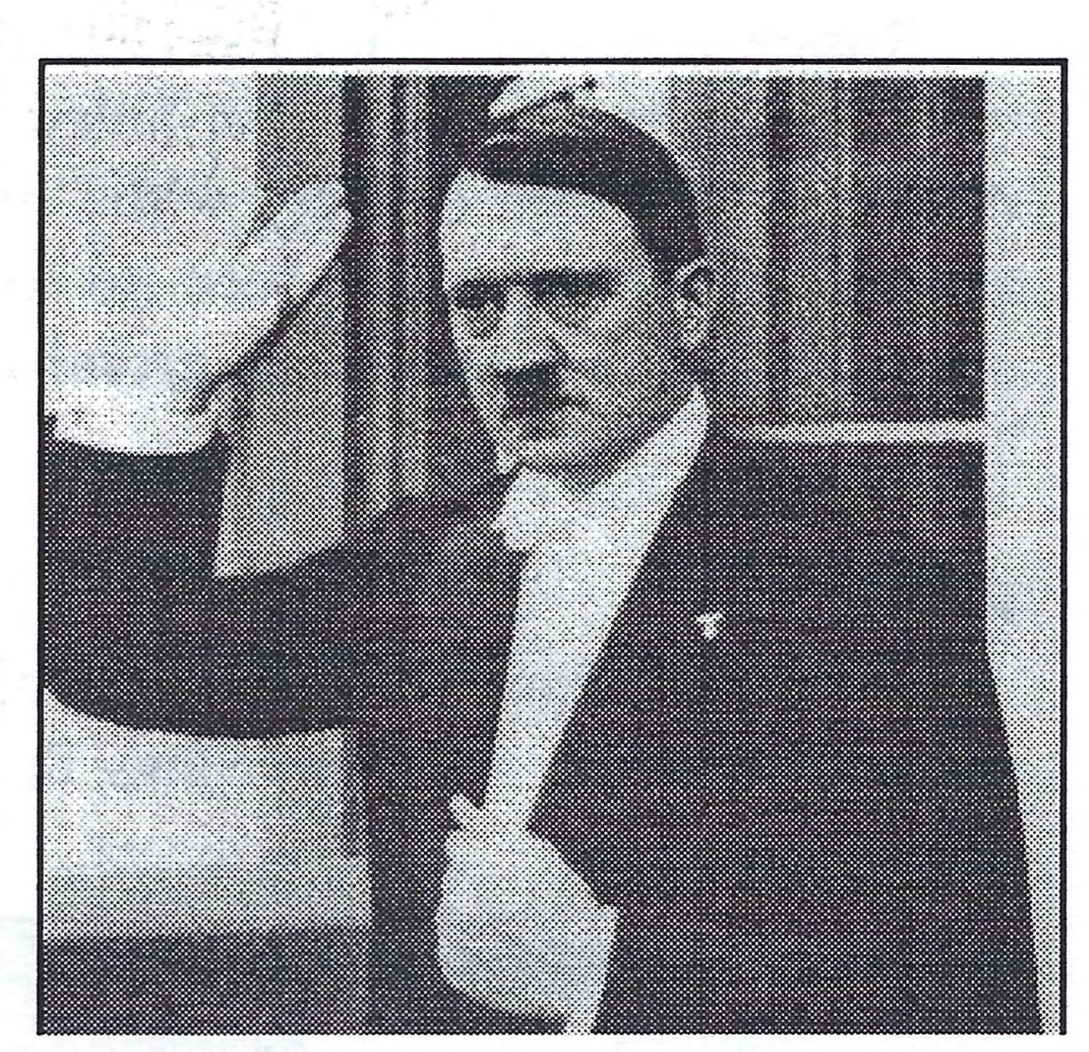
Hitler's "tails" were strictly of the tuxedo variety.

curtain. I queued up almost every night and was frequently in luck. The unsold seats that came to us were usually the best and most expensive in the house. The royal box, for instance, was empty most evenings. I was seated in it one night, together with a dozen or so students, all unknown to me, waiting for the lights to dim, when two gigantic S.S. men walked in. "All out!" they ordered. "Führer's coming!" We trooped out, into a sort of drawing room behind the royal box, where we came face to face with him and his entourage coming in. We fell back against the side walls in order that they might pass, but he stopped and, therefore, his companions stopped behind him. He apologized for turning us out of the box and said that there would be seats for us in the stalls below or maybe at the next